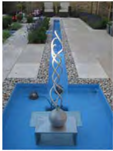
Above: the water feature incorporates a sculpture available from Aralia.

Colin and Jenny Black contacted us to help them give their rather overgrown garden a new identity. Their previous garden lacked structure. They had seen several contemporary gardens at Chelsea Flower Show and they loved the idea of incorporating elements from these into their own outdoor space. Water was a major priority for them both and so we created two bespoke water features – a raised fish pond and a long narrow Rhyll.