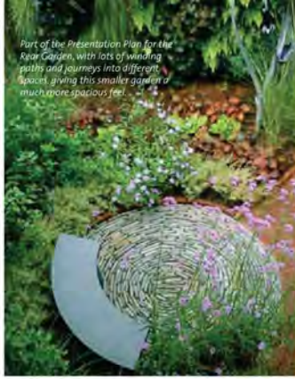
Part of the Presentation Plan for the Rear Garden, with lots of winding paths and journeys into different spaces, giving this smaller garden a much more spacious feel.

Walls and fences are so important in small gardens, eventually you want to screen most, if not all, of them – so that you blur the edges of the garden and no one can actually really see how small it is. We introduced a beautiful hardwood fence, and trellis in places, painted in a deep charcoal colour. Dark colours recede, and will make the garden look bigger, light/bright colours will pull the boundaries into the garden and make it feel smaller. Plant up with lots of lush evergreen plants such as Phyllostachys aurea (Bamboo), Phyllostachys nigra (Black Bamboo), Fatsia japonica, and shrubby climbers such as Lonciera halliana (Honeysuckle). Many climbers can easily be trained along boundaries.