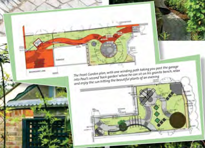
The Front Garden plan, with one winding path taking you past the garage into Paul's second 'back garden' where he can sit on his granite bench, relax and enjoy the sun hitting the beautiful plants of an evening.