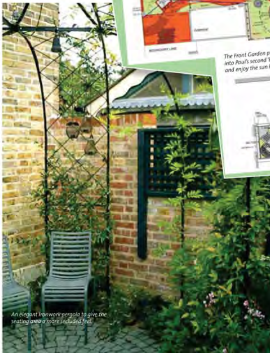
An elegant ironwork pergola to give the seating area a more secluded feel.