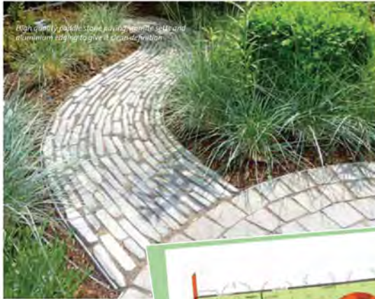
High quality paving: Stone paving, granite setts and aluminium edging to give it class & style.