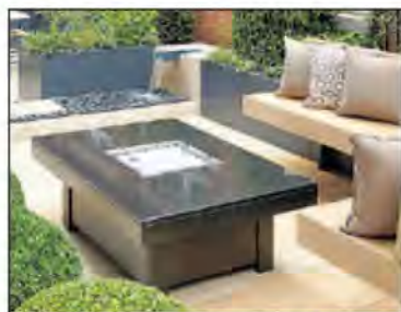
DOUBLE SALUTE: Aralia Gardens won a brace of gold awards

Awards scheme salutes the very best as top designers show off their creative instincts, reports DAVID HOPPITT